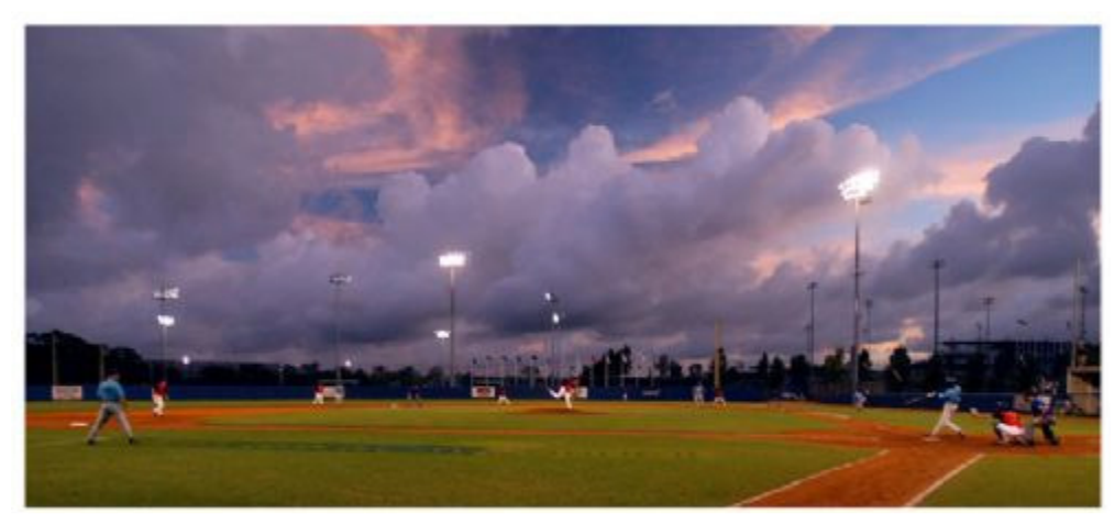
Magnificent display of storm clouds over the Claxton Shield

Despite some stiff competition New South Wales again proved to be too strong in front of their home crowd and were crowned National Champions for the second year running.